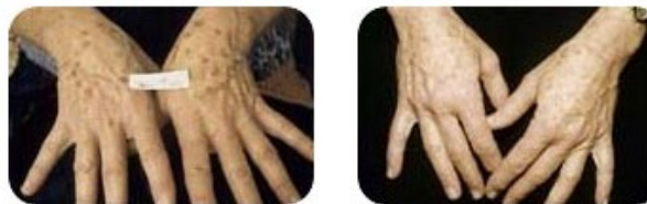
Before and 3 months after 2 IPL treatments