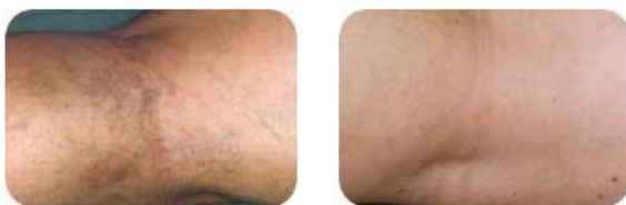
Before and 3 months after 4 IPL treatments