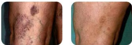
Before and 3 months after 3 IPL and 2 laser treatments over 5 days