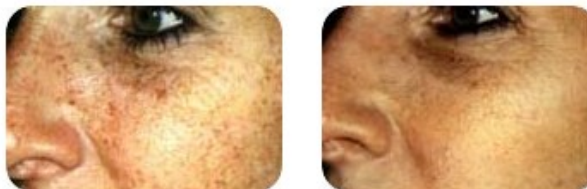
Before and 2 months post 4 IPL treatments