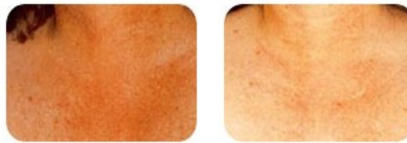
Before and 4 months after IPL treatments